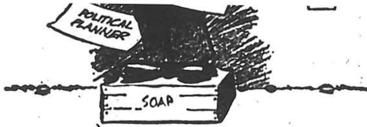
"Cradle to the Grave"