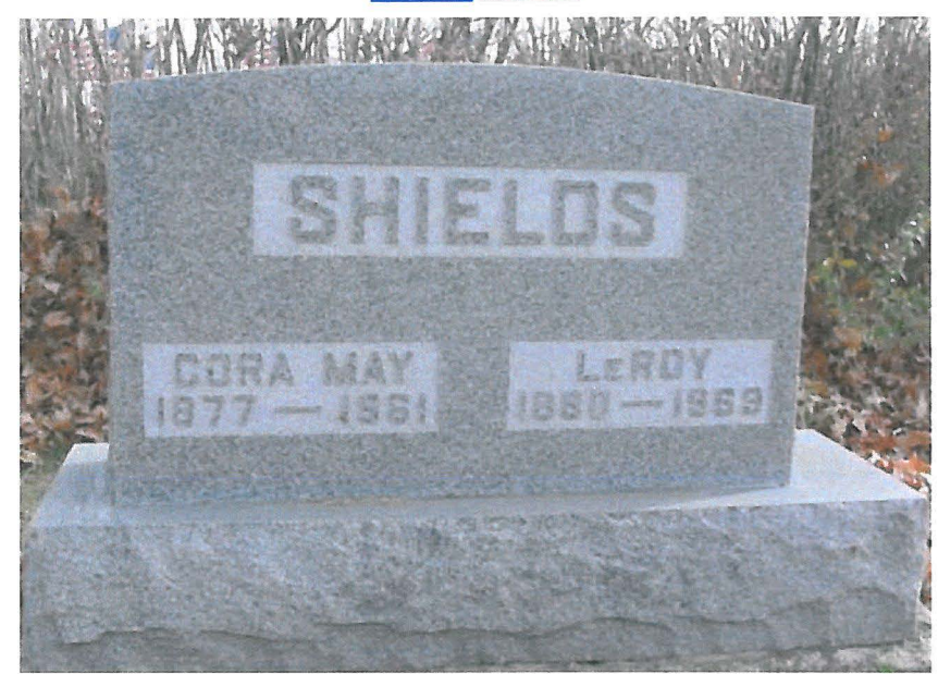
Added by: FLH 2/11/2006