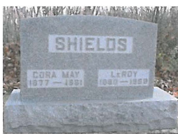
Added by: FLH

Record added: Feb 11, 2006 Find A Grave Memorial# 13314540