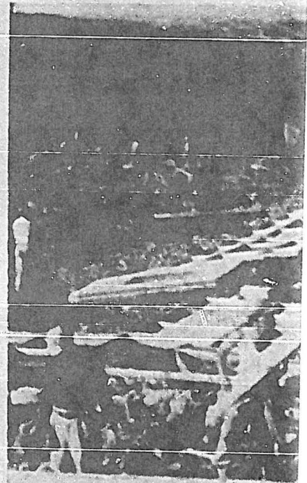
VILLAGE grows overnight as