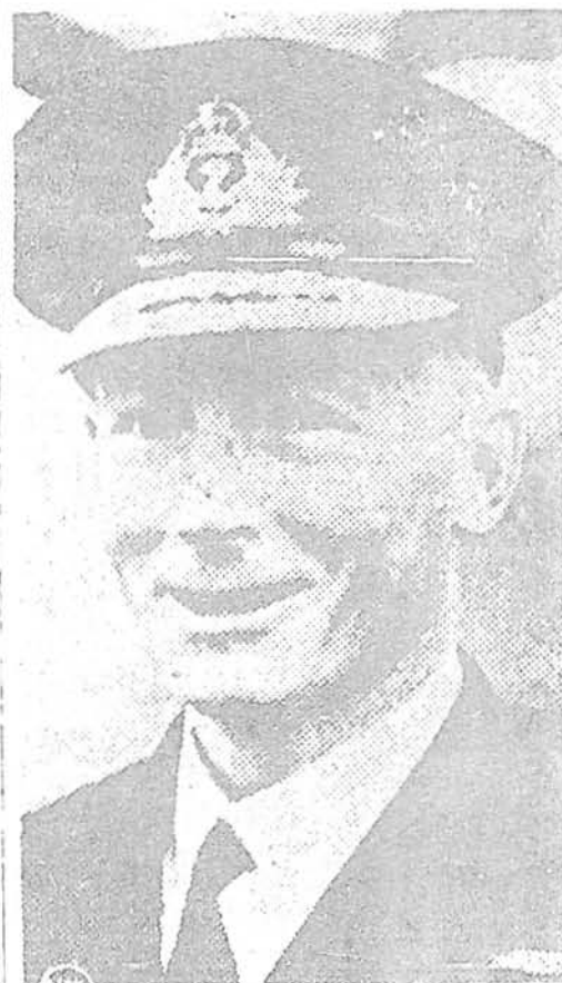
Admiral J. C. Tovey, commander-in-chief of British home fleet, who is credited with tracking down and destroying German battleship Bismarck.

treasurer of the Page County Warehouse Board. For two terms he was state senator, from 1931-35. He enjoyed his experiences in the state legislature and made many friends because of his personal contacts and his conscientious applications to the problems brought before that legislative body. He kept close to the desires of his constituency at the same time guarding the interests of the state and nation. He was highly regarded by the rural folks that he represented. In a series of radio messages he gave the public the benefit of his knowledge of farm folk and farm work and of his legislative experiences. This medium gave him a large following.