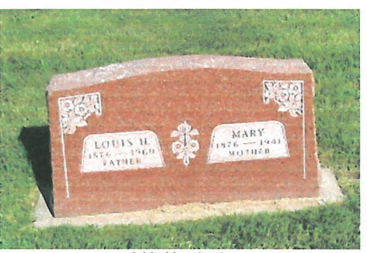
Added by: Louis 3/06/2010