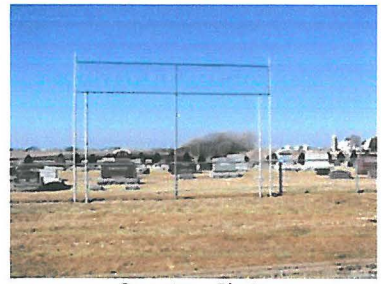
Cemetery Photo Added by: <u>Louis</u>