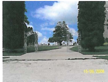
Cemetery

Created by: gerald olsen Record added: Jun 26, 2009 Find A Grave Memorial# 38771209