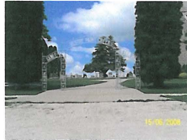
Cemetery