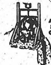
ANCHOR STOCK OILERS