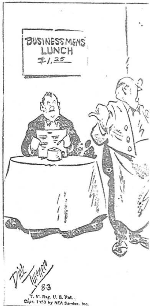
"Better make that Businessmen's from the Better Business"