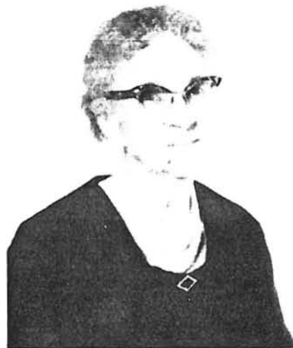
At age 90, I moved to my Apt. No. 1, Oakgrove Apt. (January 7, 1967)