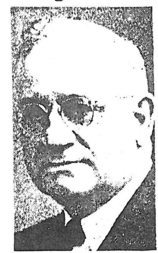
JUDGE G. R. HILL

question sent in last week: This Fluoridation of the city water supply is recommended by the Bureau of Dental Hygiene, State University of Iowa, and by Sourceelowar Telitionial DanpaState Depsiators Collection the city of Clarion taken such action? If not, who or what action must be taken