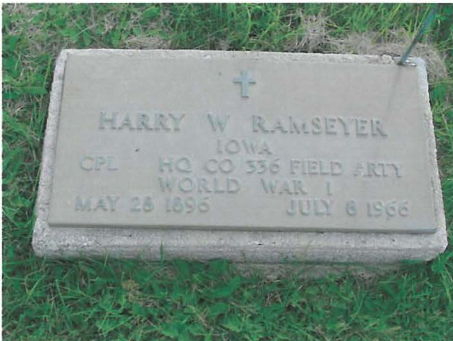
Image is scaled. Click image to open at full size. Added by: Byron & Mable Ramseyer Zeek 5/18/2007