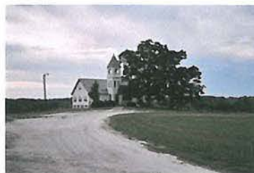
Cemetery Photo Added by: Jeremiah Brown