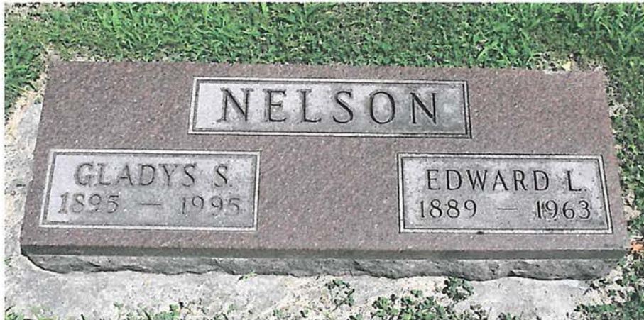
Image is scaled. Click image to open at full size. Added by: Richard Weston 6/29/2010