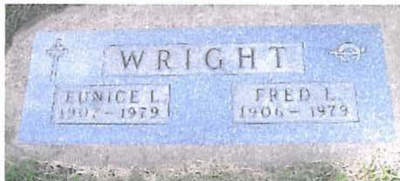
Added by: colette harrison 10/11/2009