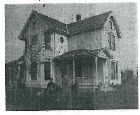
Miles Prine Homestead