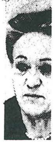
Ivy Baker Priest

SANTA MONICA, Calif. (AP) — Ivy Baker Priest, who once said "the ground of poverty qualified her for the office of Treasurer of the United States she held for eight years, died of cancer at 69. Mrs. Priest, who died Monday at St. John's Hospital in Santa Monica, came the second woman to serve