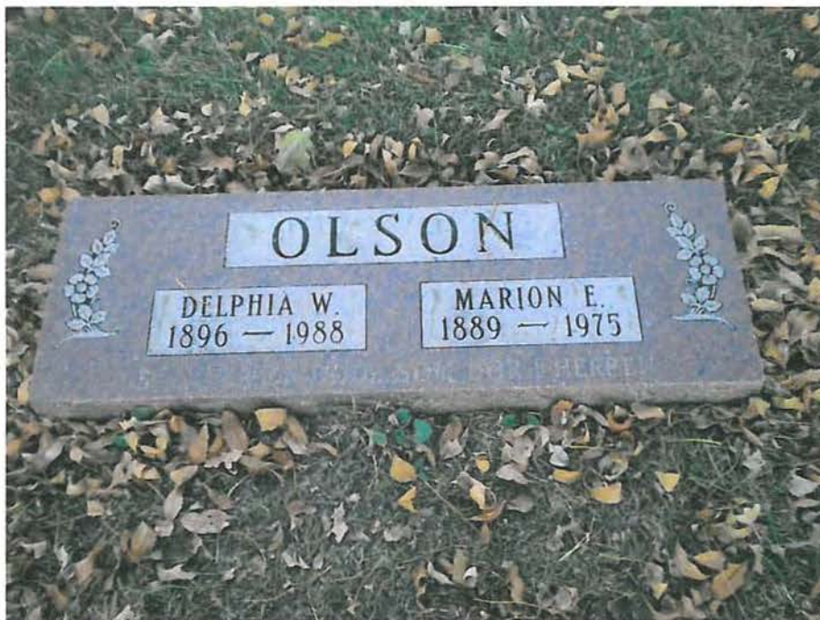
Image is scaled. Click image to open at full size. Added by: GeneGraver 11/15/2010