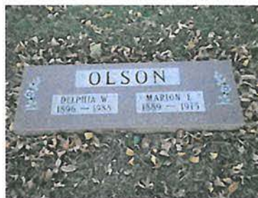
Added by: GeneGraver