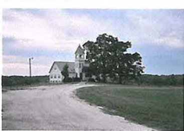
Cemetery Photo Added by: Jeremiah Brown