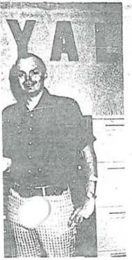
royal new Manager of the Red Oak plant, outgoing Red Oak Plant Manager

109th Year 15 Cents Monday, June 7, 1976