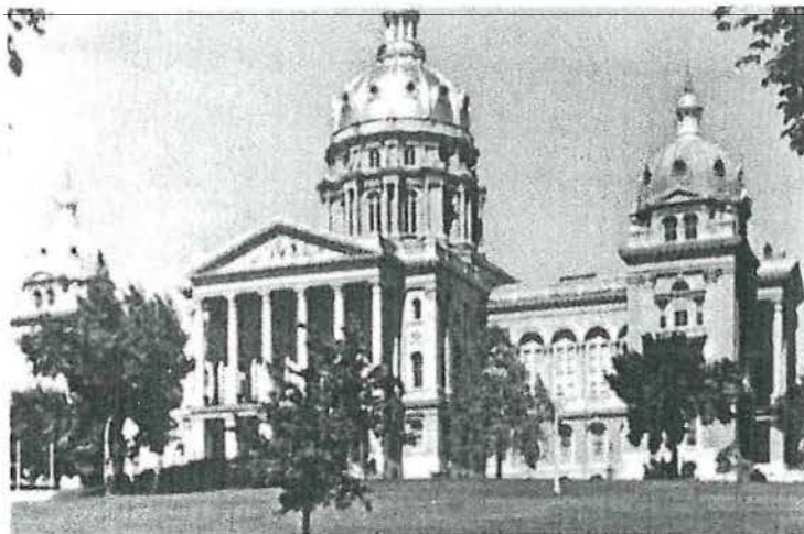
Shelby countians in Iowa Government NELSON KRASCHEL, LT. GOV. 1932-36 Gov. — 1937-38