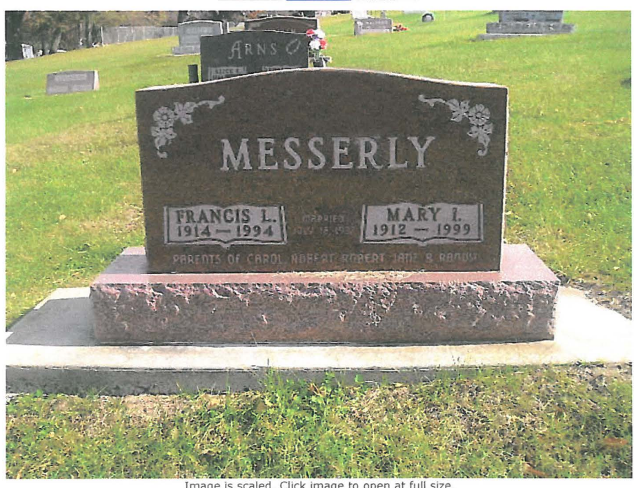
Image is scaled. Click image to open at full size. Added by: <u>Louis</u> 3/09/2010