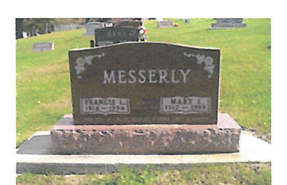
Added by: Louis