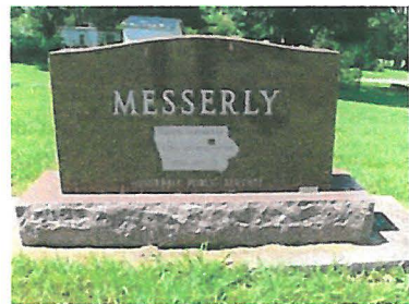
Added by: Anonymous

Record added: Mar 09, 2010 Find A Grave Memorial# 49473904