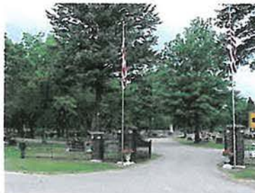
Cemetery Photo Added by: parsong