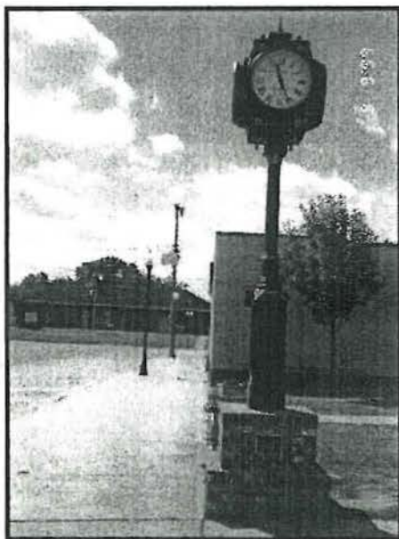
Community Clock in memory of Bill Rabedeaux located on the corner of Maurer and 4th St. - Dedicated in 1997