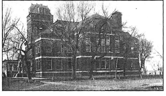
Top: Lightning struck high tower on this original building. Left: The courthouse before hitching chains were removed and there was no pavement. Above: Early courthouse photo. Below: Courthouse with paved roads.