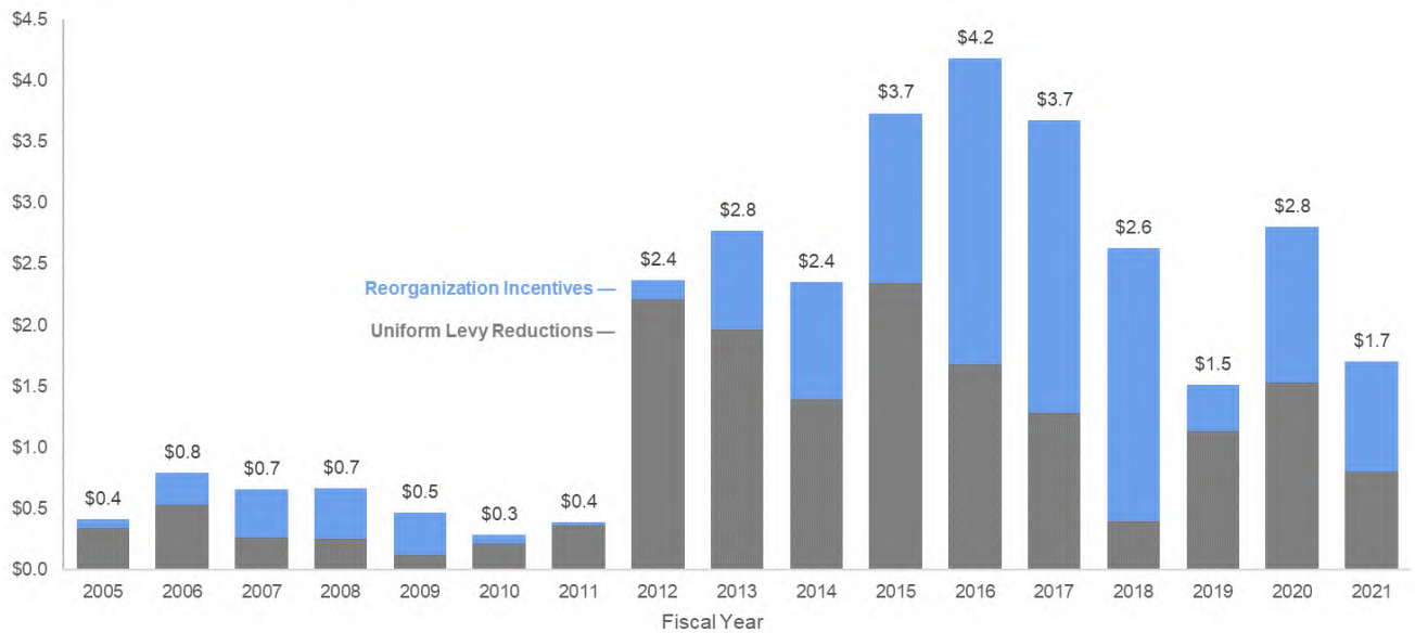
State Aid Costs by Category (in millions)

The following chart shows the amount of State aid provided in uniform levy reductions and the amount of State aid provided for reorganization incentives. Since FY 2004, State aid cost for uniform levy reduction has totaled $16.2 million, and the estimated State aid cost for reorganization incentives has totaled $13.7 million during the same time frame.