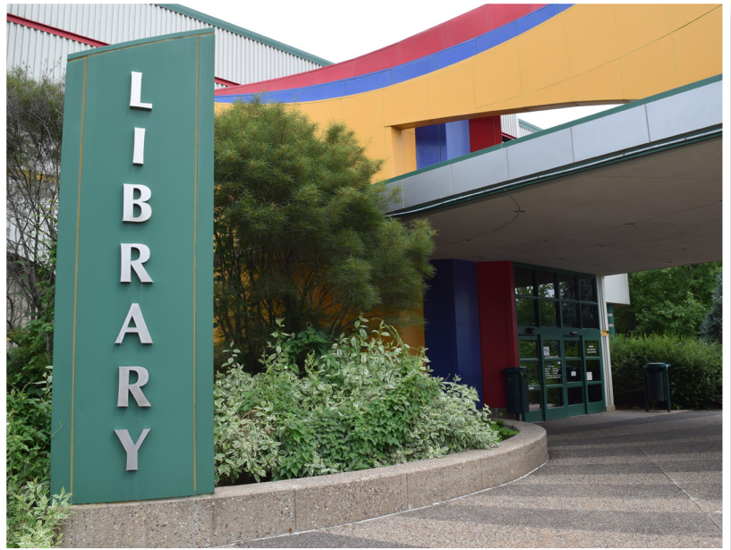
Bettendorf Public Library

The state reimburses the loaning library a small amount for each item to offset expenses.