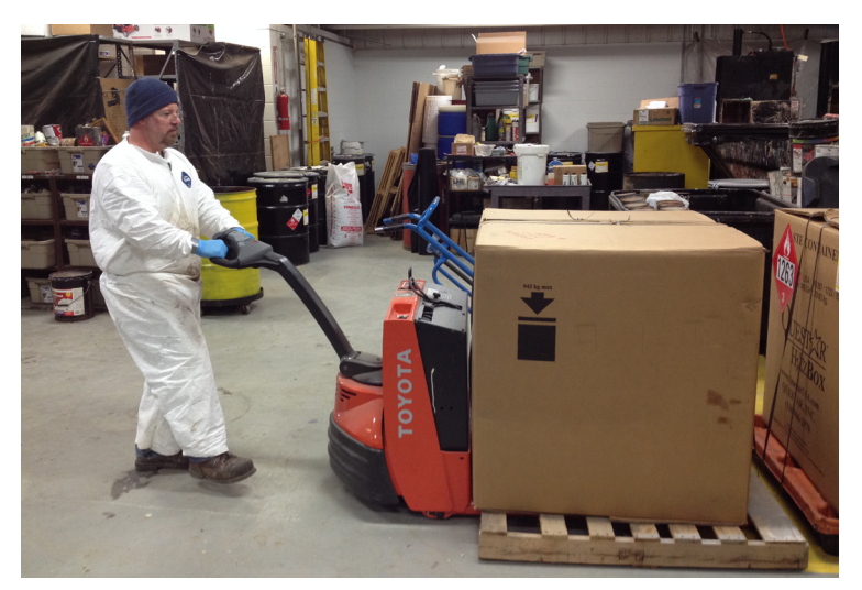
Above: A worker at the Bondurant RCC uses a new electric pallet jack purchased with the DNR's RCC innovation grant to move boxes of HHMs.