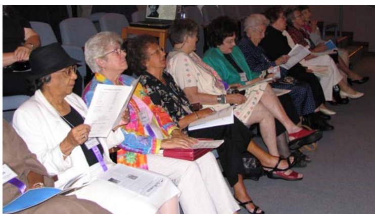
Iowa's Women Hall of Fame Members at the 2006 Iowa Women's Hall of Fame.