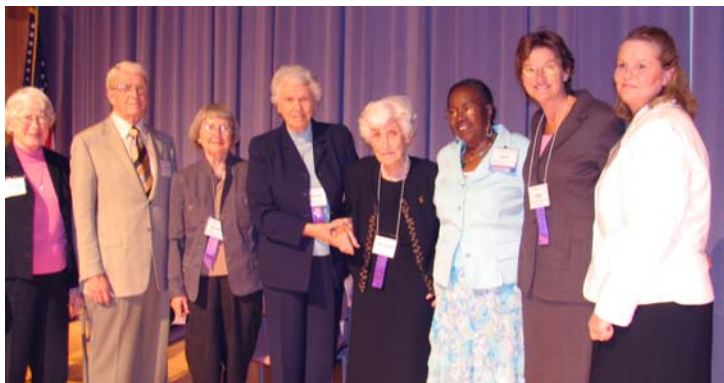
Iowa Women's Hall of Fame Ceremony, August 26, 2006.