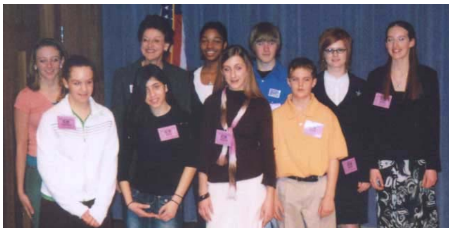
Lt. Governor Pederson with the winners from the Write Women Back Into History Essay Contest