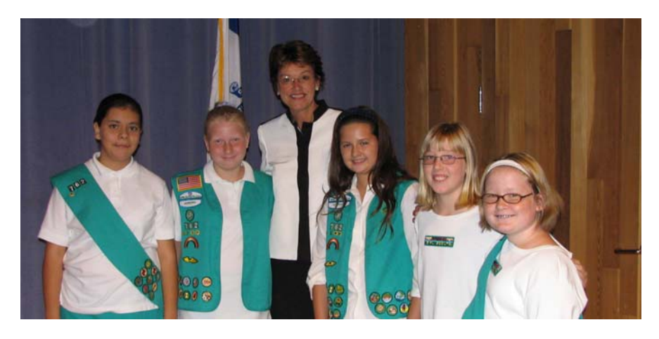
Lt. Governor Pederson with the Girl Scouts who presented the flags at the 2005 Iowa Women's Hall of Fame.