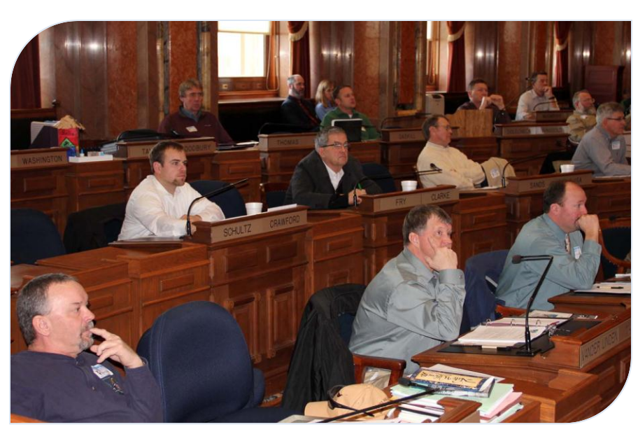
REAP Delegates listening to a speaker at the 2012 REAP Congress.