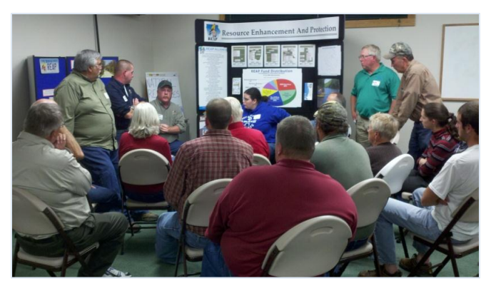
Residents discuss natural resources conservation at the Maguoketa REAP Assembly on September 27.