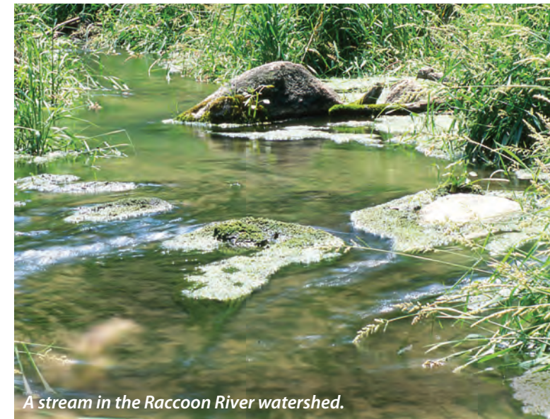
A stream in the Raccoon River watershed.