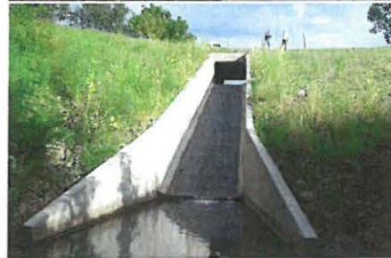
Top: 4 foot high sheet pile weir with a 1:20 grouted riprap slope in Crawford County. Bottom: RCB flume with 25 feet of fall in Fremont County.