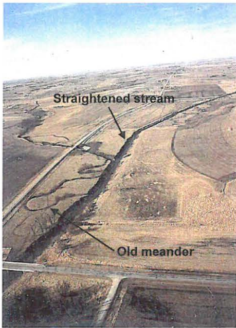
Straightened versus meandering stream. (Walnut Creek, Pottawattamie County).