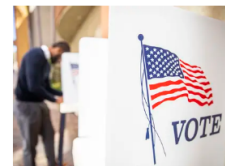
Elections & Government

OCIO estimates every engagement with the chatbot saves approximately 5 minutes staff time. Approximately 16,000 lowans asked questions of the chatbot. The Phone calls to agencies are likely diverted by the chatbot as lowans get answers to their questions. The chatbot allows for escalation to live chat with a state reference librarian during business hours. Some of the most commonly asked questions this year included: