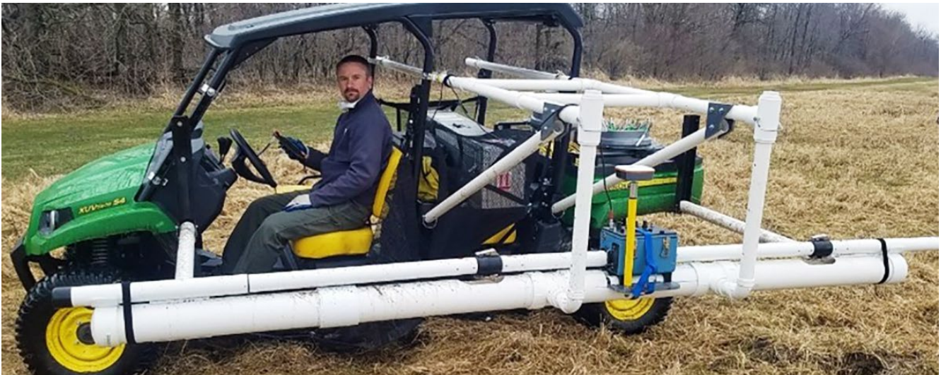
EM geophysical unit on Gator UTV.

The goal for the 2023 fall survey season included 25 levees and 12 levee sponsors split between western, central, and eastern Iowa. IGS dedicated one staff member working full time and three additional staff members working part time on the project, resulting in approximately 520 hours of work to complete the physical survey of the selected levees. Major tasks included communicating with representative levee districts, coordinating field activities, and collecting electromagnetic geophysical data. In addition, approximately $6,000 worth of equipment use charges were included in the field efforts, including the use of the electromagnetic meter, utility task vehicle and trailer, vehicle, and GPS units.