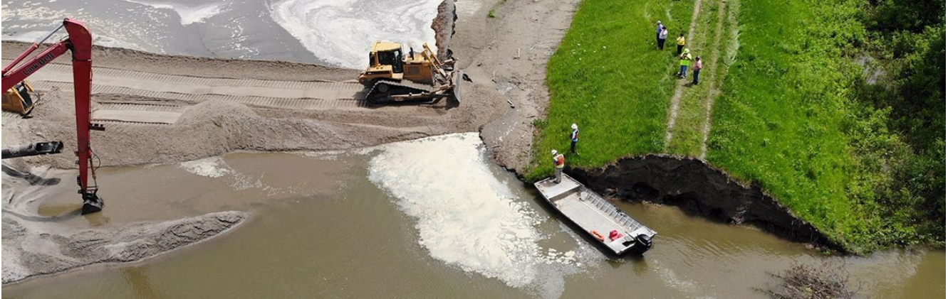
The U.S. Army Corps of Engineers, Omaha District, completes an initial breach closure on levee L575 near Percival, Iowa, on June 20, 2019.

The other significant federal stakeholder is FEMA. Where USACE certifies a levee's structure and operations, FEMA accredits a levee's flood protection against a 100-year flood. Residents and businesses behind an accredited levee are not required to maintain costly flood insurance on their properties. The loss of a levee's accreditation can have significant economic impacts on a community. Non-federally constructed levees that have never been enrolled in the PL 84-99 program may be eligible for federal assistance through FEMA's Public Assistance Program. Federally constructed levees or levees enrolled in the PL 84-99 program are ineligible for FEMA disaster assistance funding regardless of whether the levees are currently enrolled.