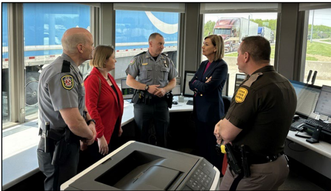
Governor Reynolds tours the Dallas county scale on May 16, 2023 after signing Senate File 513 into law.

On June 23, 2023, a total of 100 positions transferred from the Department of Transportation to the Department of Public Safety. The 100 positions were comprised of 98 sworn officers and two civilian positions. At the time of the transfer, there were 82 filled sworn officers and one filled civilian position.