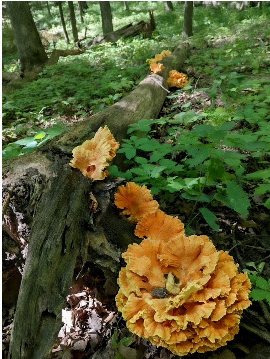
White Pine Hollow State Preserve, Dubuque County

Iowa State Preserves Advisory Board and Conservation and Recreation Division Iowa Department of Natural Resources