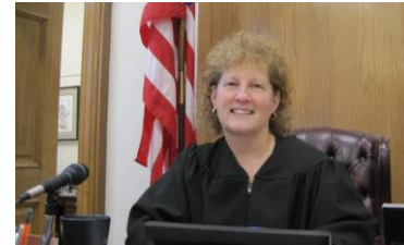
Helping Babies from the Bench

DHS also supports the Early ACCESS system through its administration of the Infant and Toddler Medicaid Program. This program provides funding for early intervention services that are related to a child's medical needs. Sixty-four percent of infants and toddlers in Early ACCESS are Medicaid eligible.