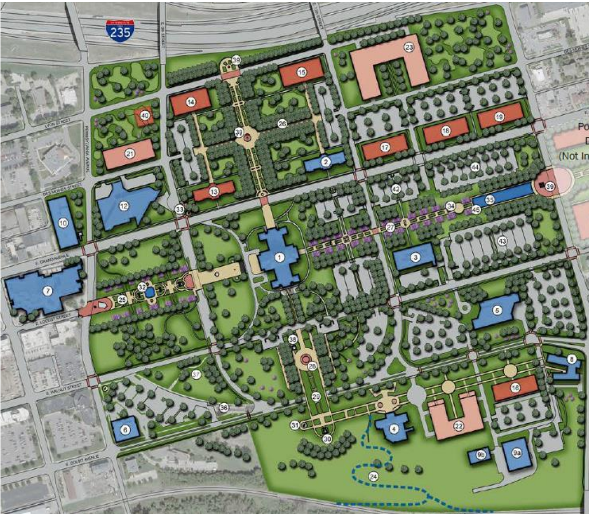
View of the Capitol Complex Master Plan as amended 2018