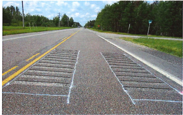
Hossein Naraghi, InTrans

Research has shown using a shallower depth rumble has resulted in lower external noise while still producing adequate internal noise to be effective. However, an optimal depth/noise ratio has not been well established.