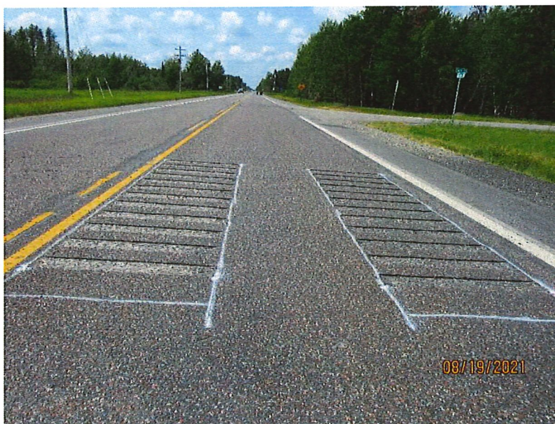
Hossein Naraghi, InTrans

A few states utilize a standard design that uses a wheel-path only TRS design. This allows for the accommodation of bicyclists and motorcyclists who can avoid traversing the rumbles by traveling in the space between them. States with wheel path designs include Minnesota, New Mexico, and Texas (see Figure 2).