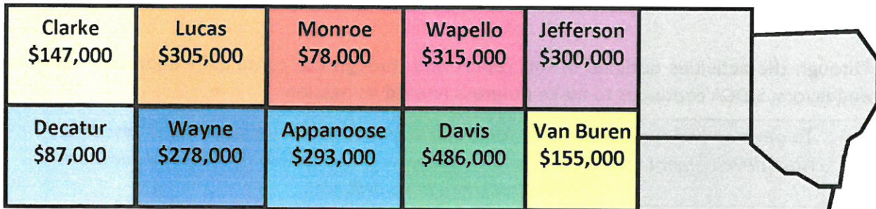
SIDCA Funds Utilized in Each Member County for Completed Projects (2002—2018)