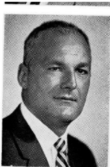
SCHERLE, William J., Henderson Mills County Republican