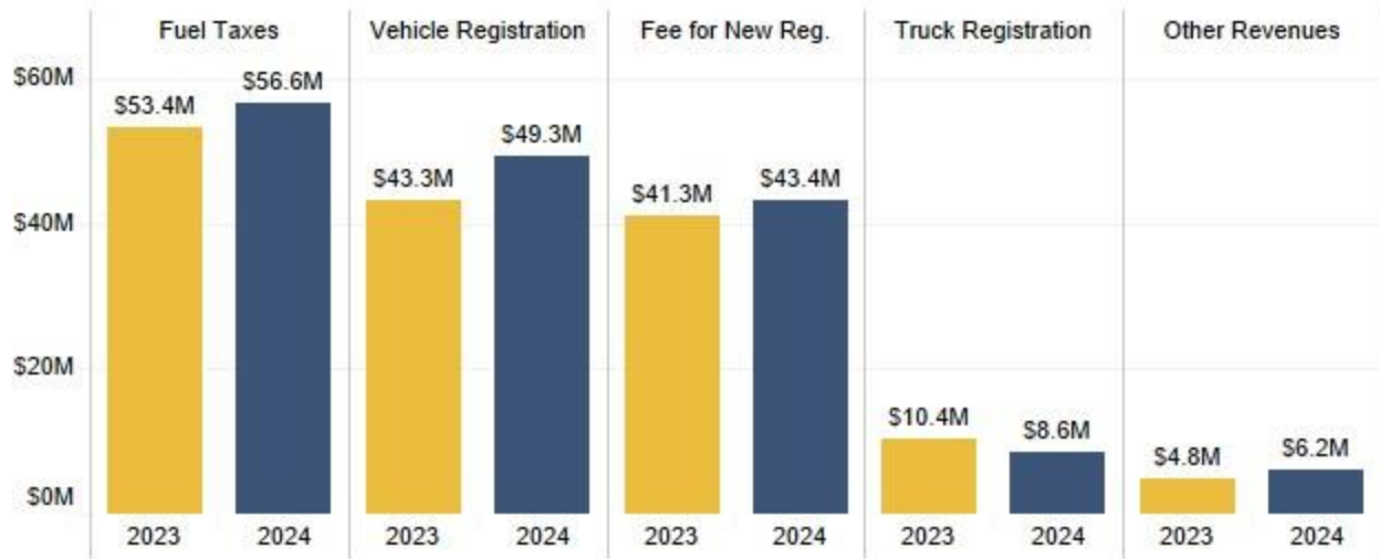
June Distributions by Revenue Source FY 2023 vs FY 2024

Note: Year-over-year difference may not match the narrative description due to rounding.