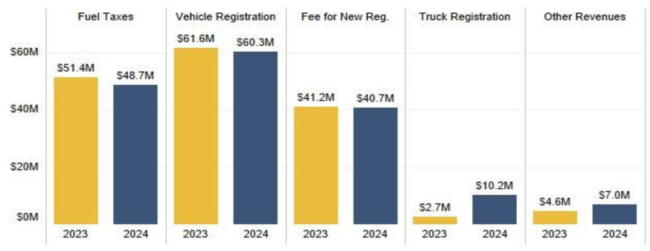
March Distributions by Revenue Source FY 2023 vs FY 2024

Note: Year-over-year difference may not match the narrative description due to rounding.