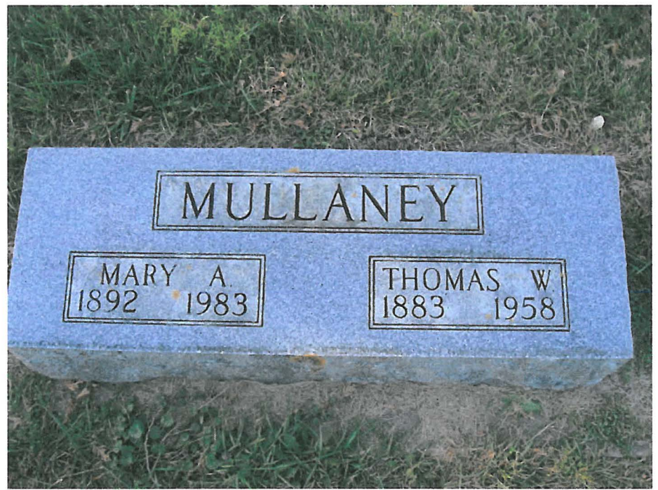
Image is scaled. Click image to open at full size Added by: Duane Heit 12/03/2010