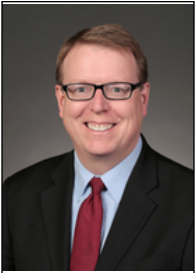
Senator Hogg, Robert