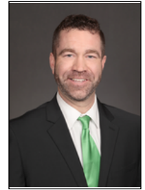
Senator Green, Jesse