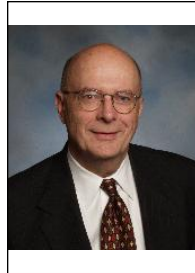
Senator Redfern, Donald B.