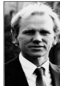
Representative Hansen, Steven D.