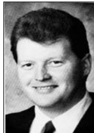
Representative Murphy, Patrick J.