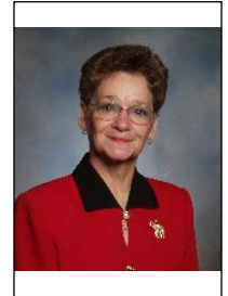
Senator Rehberg, Kathleen