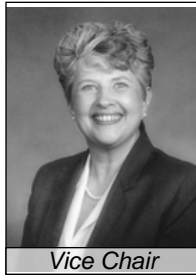
Vice Chair Representative Beatty, Linda L.