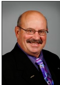
Senator Taylor, Rich